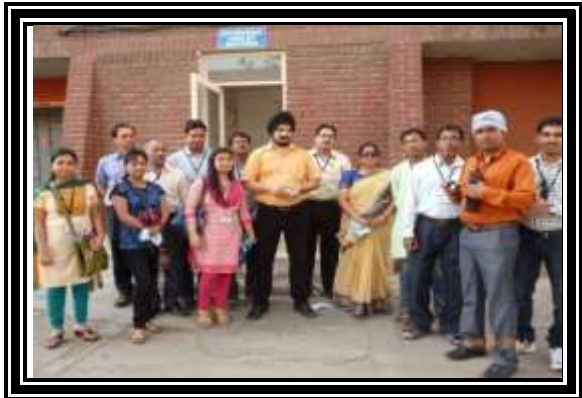
Educational Tour at Agra