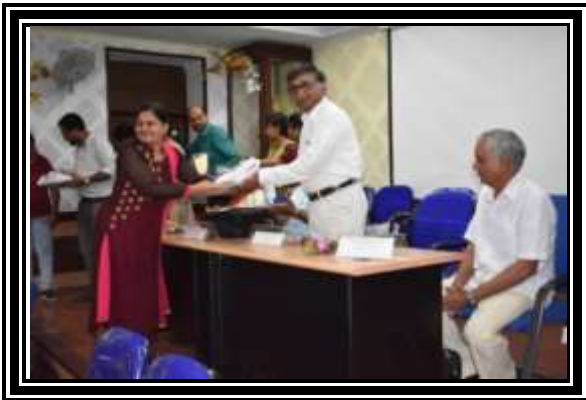
CME PROGRAMME 2019