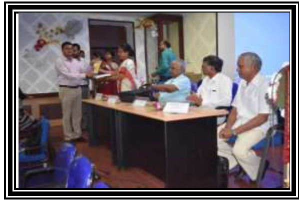
CME PROGRAMME 2019