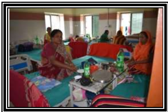
IPD (Panchakarma Male Ward)