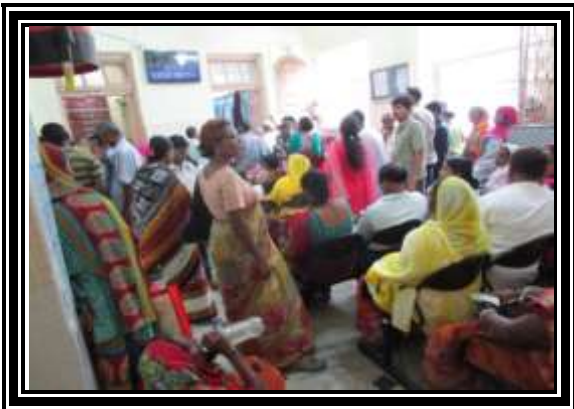
OPD Waiting Room