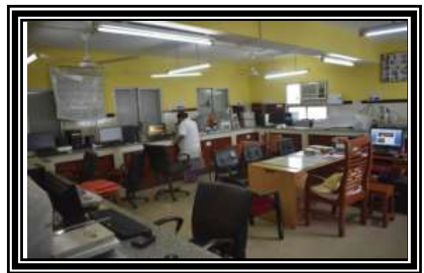
Instrument Room & Chemical Laboratory