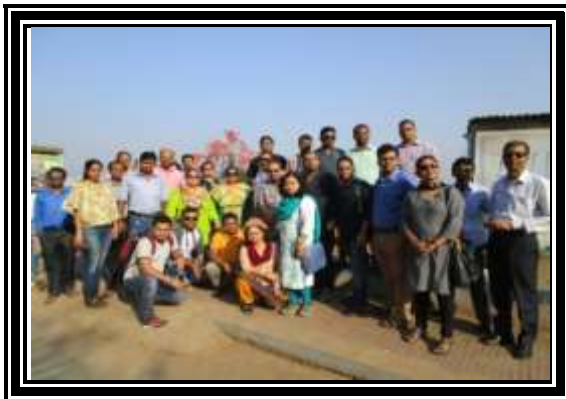
Educational Tour at Mukutmanipur