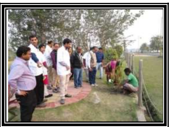
Documentary at Herbal Garden