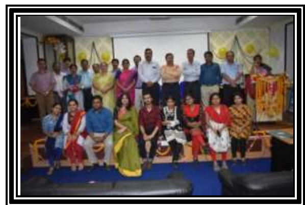
Teachers and 3 rd year Students 2019