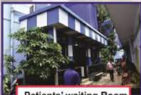
Patients' waiting Room