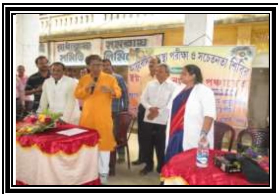
Medical camp at Medinipur