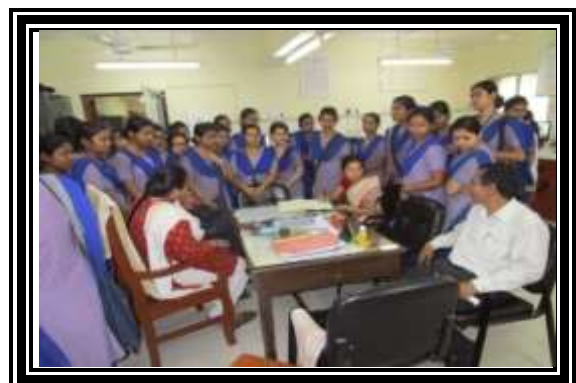
Visit of Nursing Students