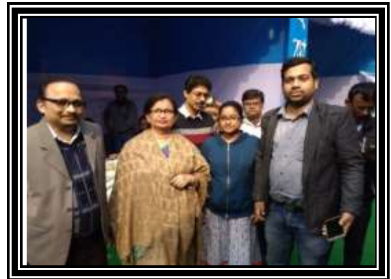
Medical camp at Hazra