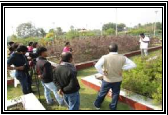
Documentary at Herbal Garden