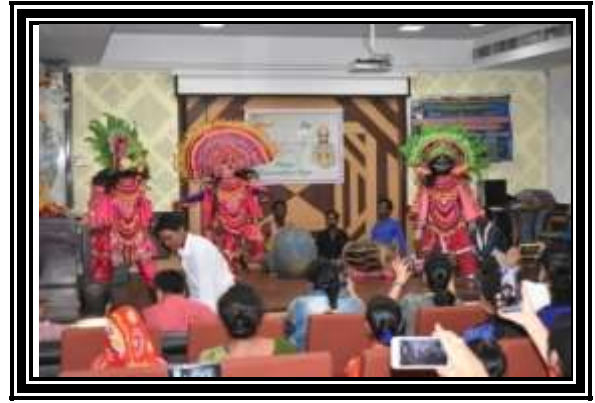
CME PROGRAMME 2019