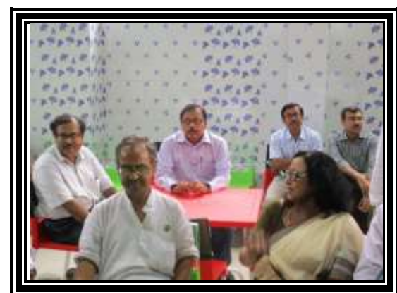
INAUGURATION OF CANTEEN