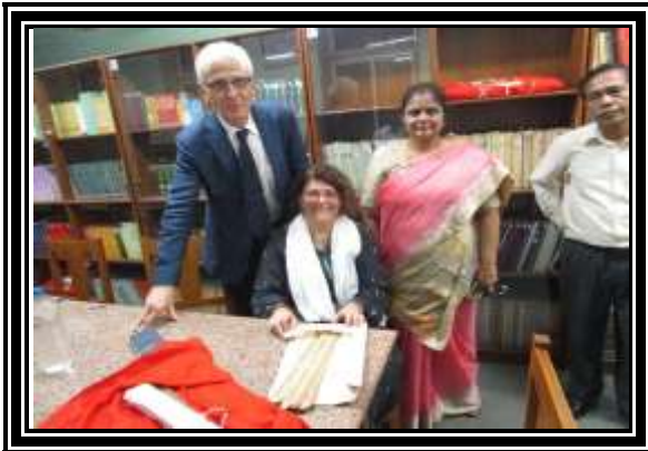
VISIT Foreign Delegate