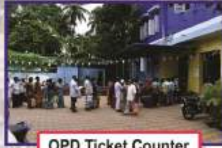
OPD Ticket Counter