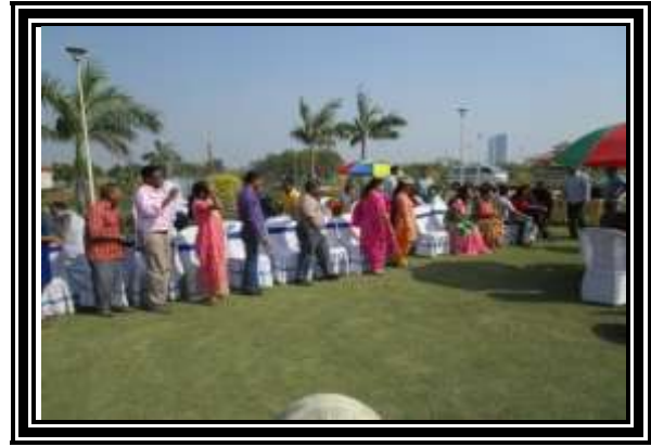
PICNIC at Eco park