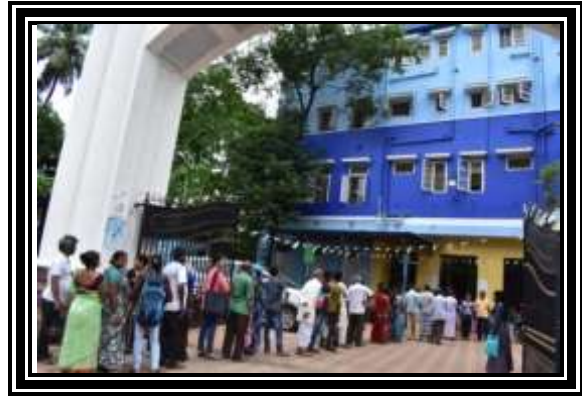
OPD Ticket Counter