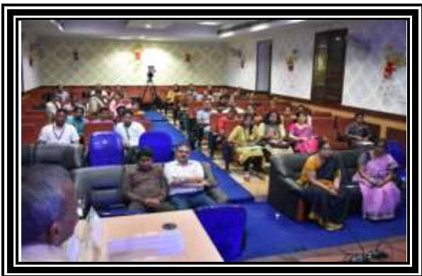
CME PROGRAMME 2019