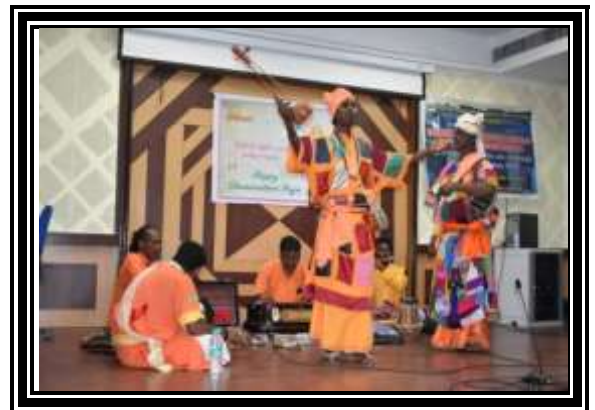
CME PROGRAMME 2019