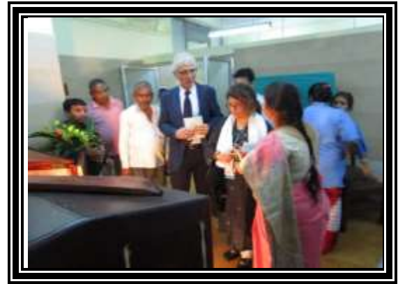
VISIT Foreign Delegate