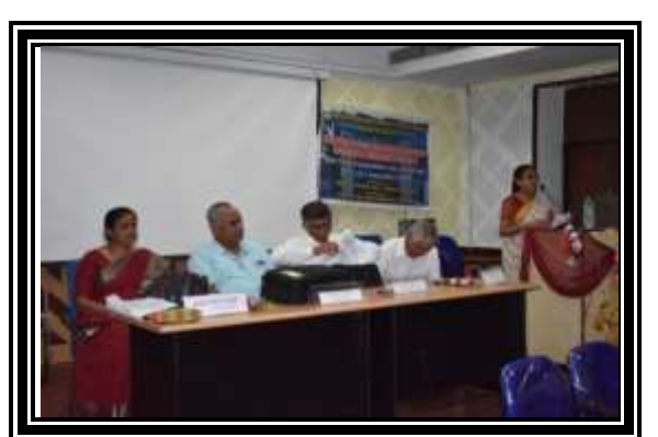
CME PROGRAMME 2019