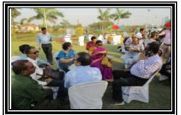
PICNIC at Eco park