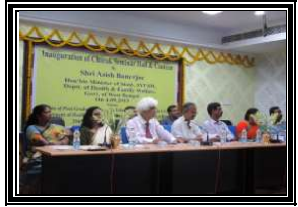
Inauguration of Charak seminar Hall