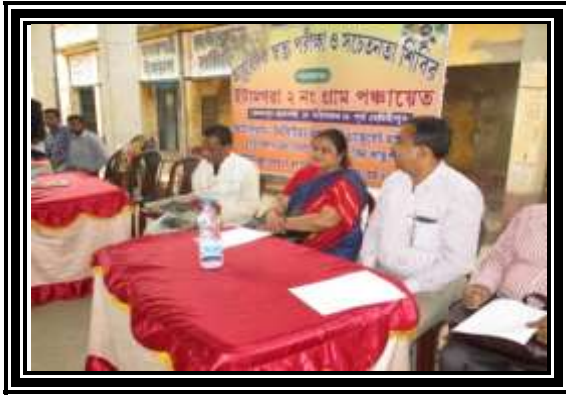
Medical camp at Tamluk