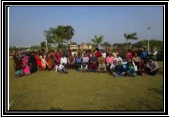
PICNIC at Eco park