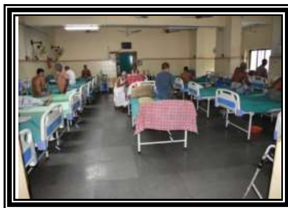
IPD ( Panchakarma Female Ward)