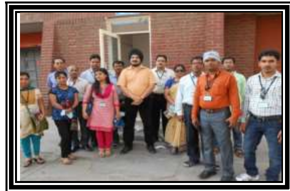
EDUCATIONAL TOUR AT AGRA