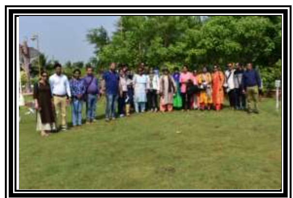
CME PROGRAMME 2019