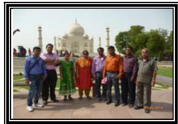
EDUCATIONAL TOUR AT AGRA