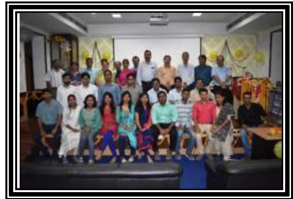
Teachers and 1 st year Students 2019