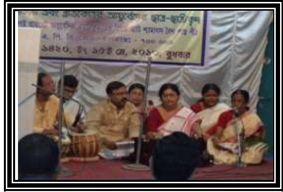
Foundation day celebration