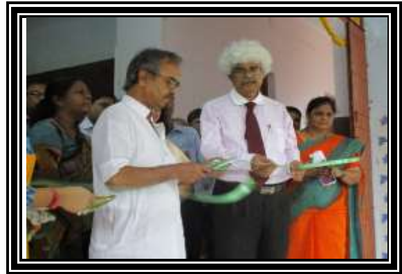
INAUGURATION OF CANTEEN