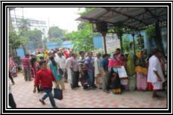
OPD Ticket Counter