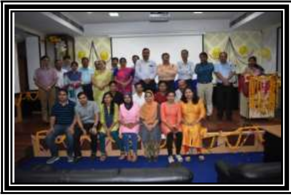
Teachers and Newcomer 1 st year students 2019