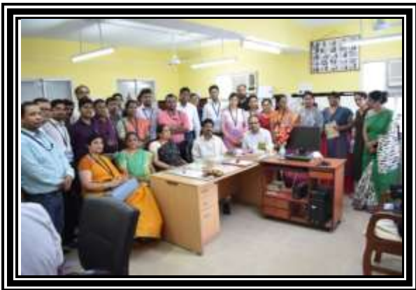
CME PROGRAMME 2019