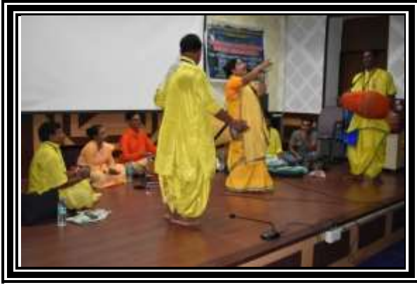
CME PROGRAMME 2019