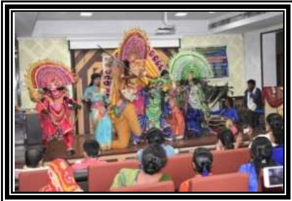
CME PROGRAMME 2019