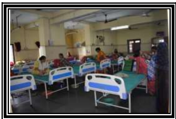
IPD (Female Ward)