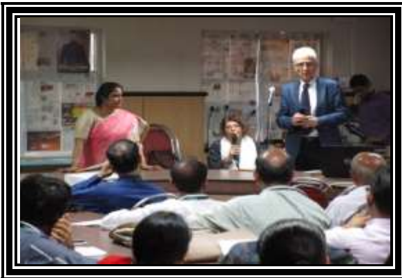
VISIT Foreign Delegate