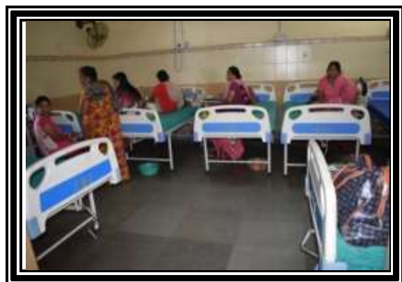
IPD (FEMALE WARD)