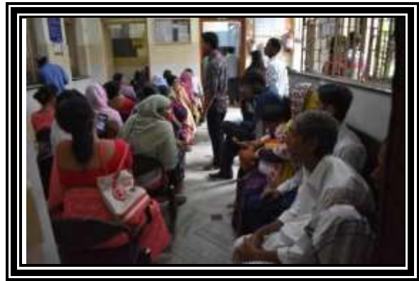
OPD Waiting Room