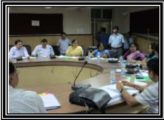
Visit Minister Shashi panja