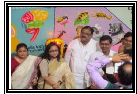
Inauguration of Panchakarma unit