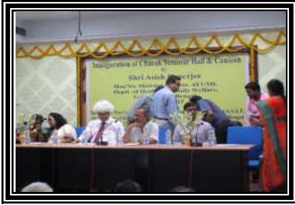
Inauguration of Charak seminar Hall