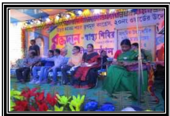
Medical camp at Birati