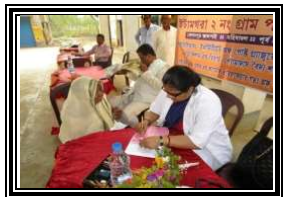
Medical camp at Medinipur