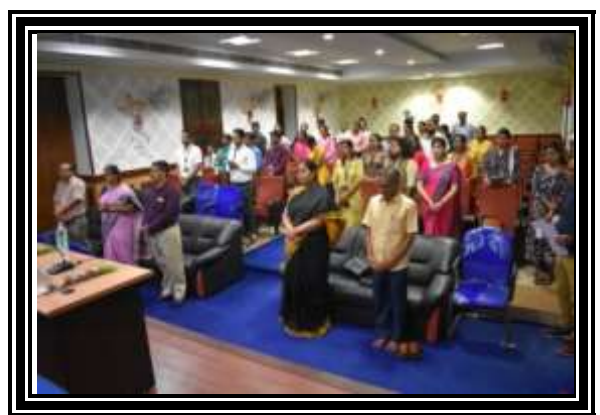
CME PROGRAMME 2019