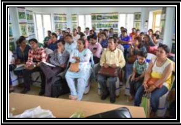
CME PROGRAMME 2019