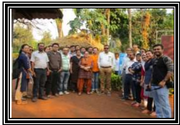
EDUCATIONAL TOUR AT JHARGRAM