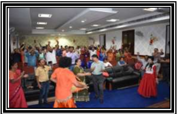
CME PROGRAMME 2019