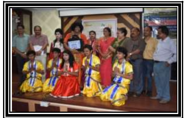
CME PROGRAMME 2019