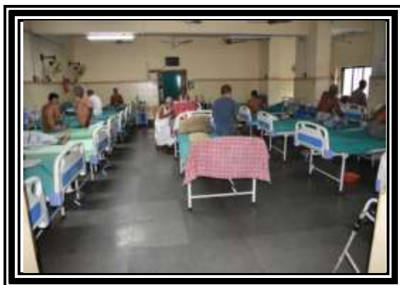
IPD (Male Ward)