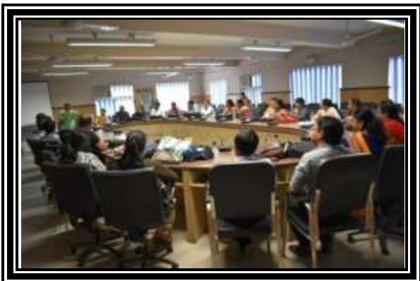
CME PROGRAMME 2019