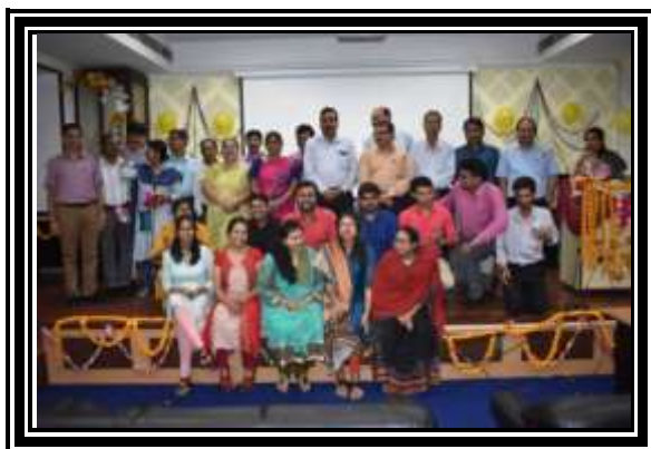
Teachers and 2 nd year Students 2019