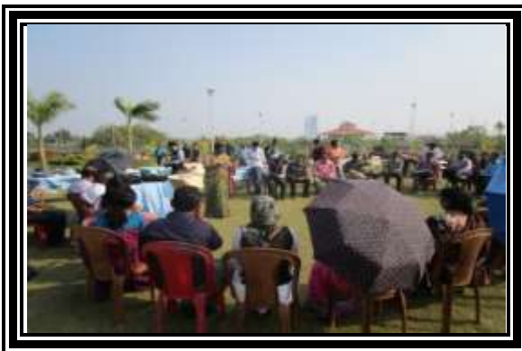
PICNIC at Eco park