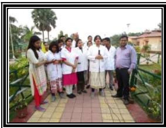
Documentary at Herbal Garden