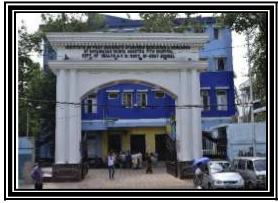
I.P.G.A.E. & R. AT S.V.S.P.