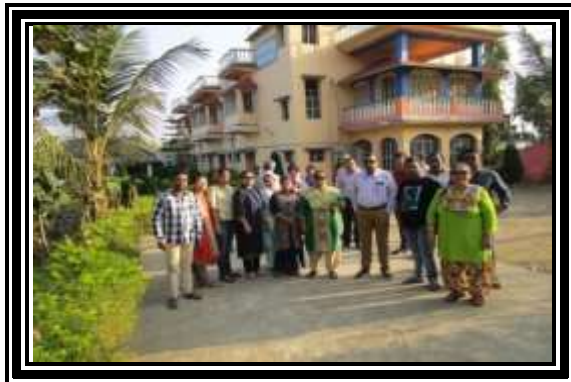
EDUCATIONAL TOUR AT MUKUTMANIPUR