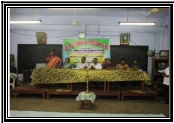
Medical camp at Medinipur