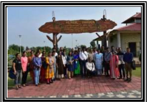
CME PROGRAMME 2019