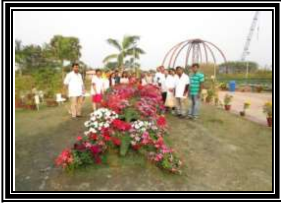
Documentary at Herbal Garden