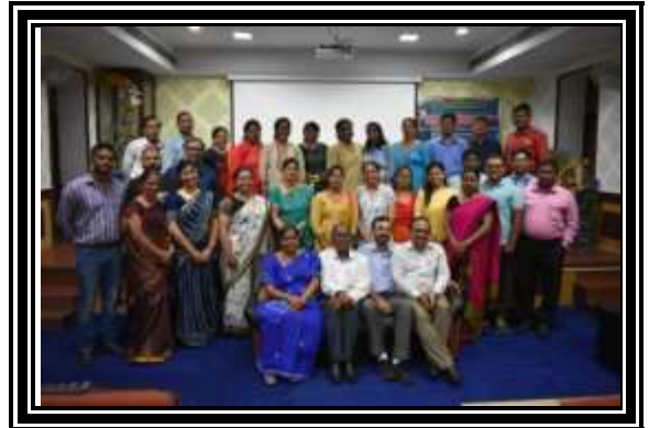
CME PROGRAMME 2019