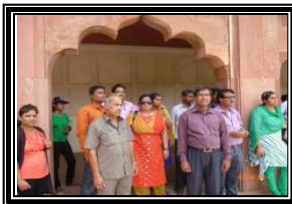
EDUCATIONAL TOUR AT AGRA