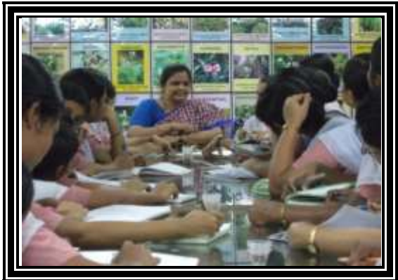
Visit of Nursing Students